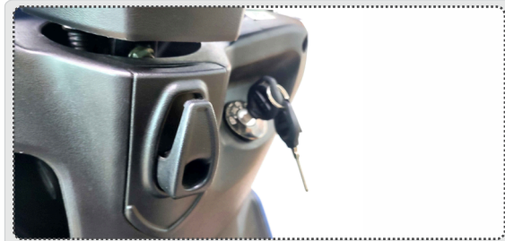
Premium Bag Hook